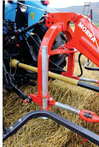
Sturdy three-point hitch frame