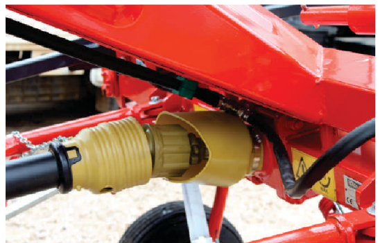
Easy PTO shaft connection