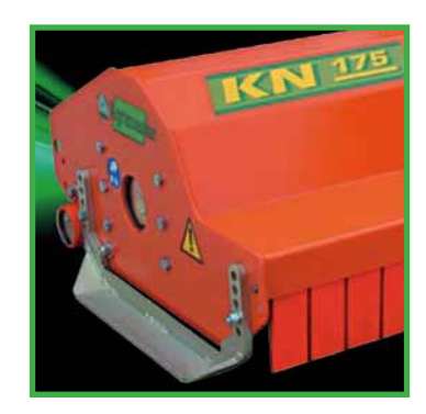
Height adjustable skids.