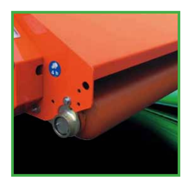
Height adjustable and self cleaning 194mm diameter roller with reinforced bearings.