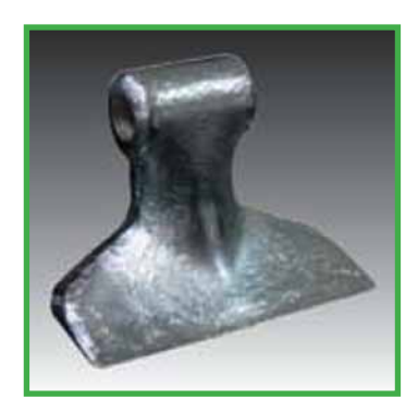
Standard Hammer for local Shredders.