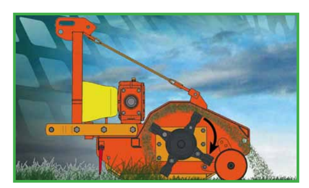
Clockwise rotation of belt driven hammer roller deposit cuttings behind adjustable 194mm diameter support roller.

Agrimaster Shredders are made from high strength FE 510 sheet steel. It discharges shredded material from behind the roller. KN Shredders are ideal for grasses of varying heights, uncultivated land undergrowth with shrubs of up to 4/5cm in diameter as well as orchard, vineyard and maize stalks.