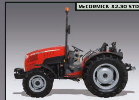
MCCORMICK X2.30 STD