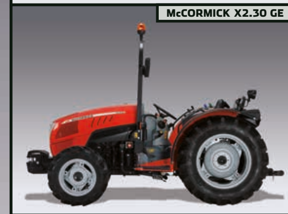
MCCORMICK X2.30 GE