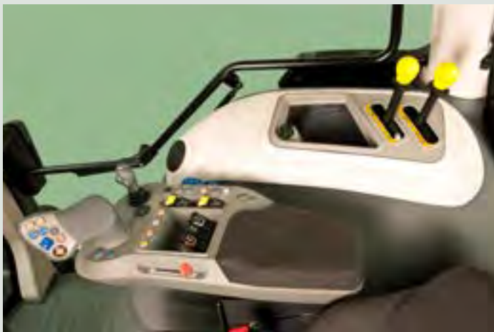
X7 P6-Drive models available in premium configuration feature our premium cab with multi-function controls integrated into the right-hand armrest featuring the latest technology.

The cab is pressurized to keep a clean, dust free environment and has a sound level of only 70 dBa. A highly efficient automatic climate control in Premium models maintains the desired cab temperature regardless of the outdoor weather conditions. To further increase operator comfort, an electronically-controlled hydraulic cab suspension system is available as an option.