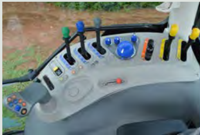
X7 P6-Drive models available in standard configuration feature our efficient cab with multi-function controls integrated into the right-hand console featuring mechanical valve controls.